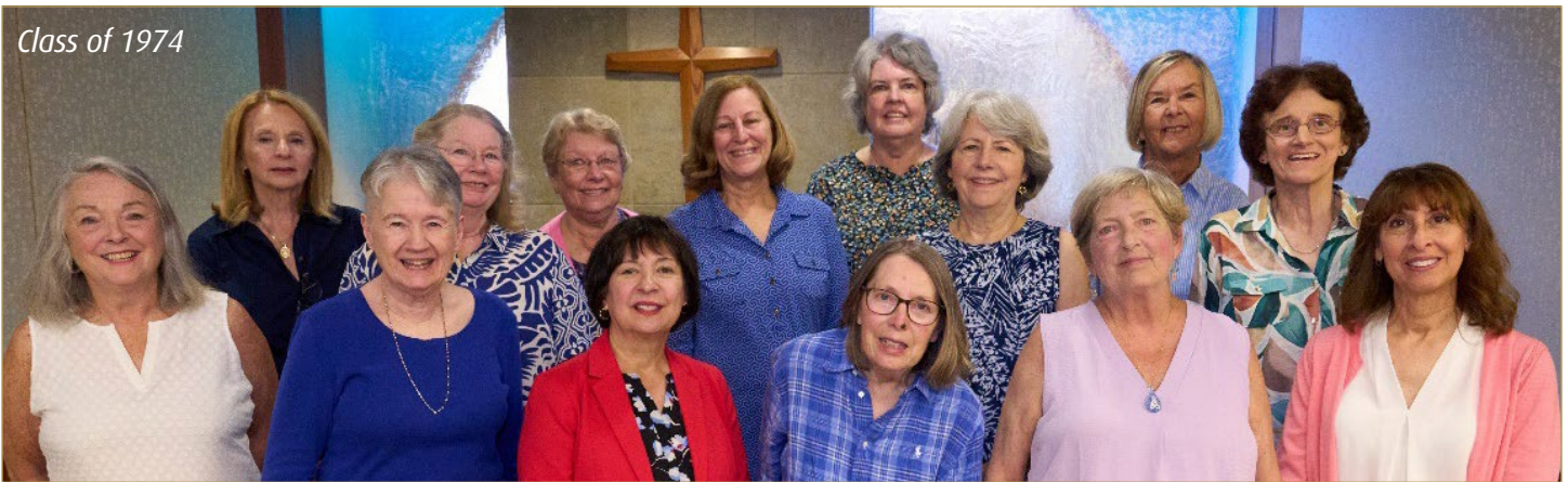
Class of 1974

St. Joseph's College of Nursing at St. Joseph's Hospital Health Center