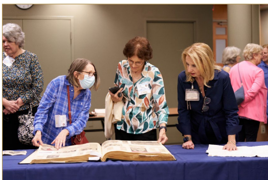
Class of '74 members reminisce while viewing memorabilia at the reunion.